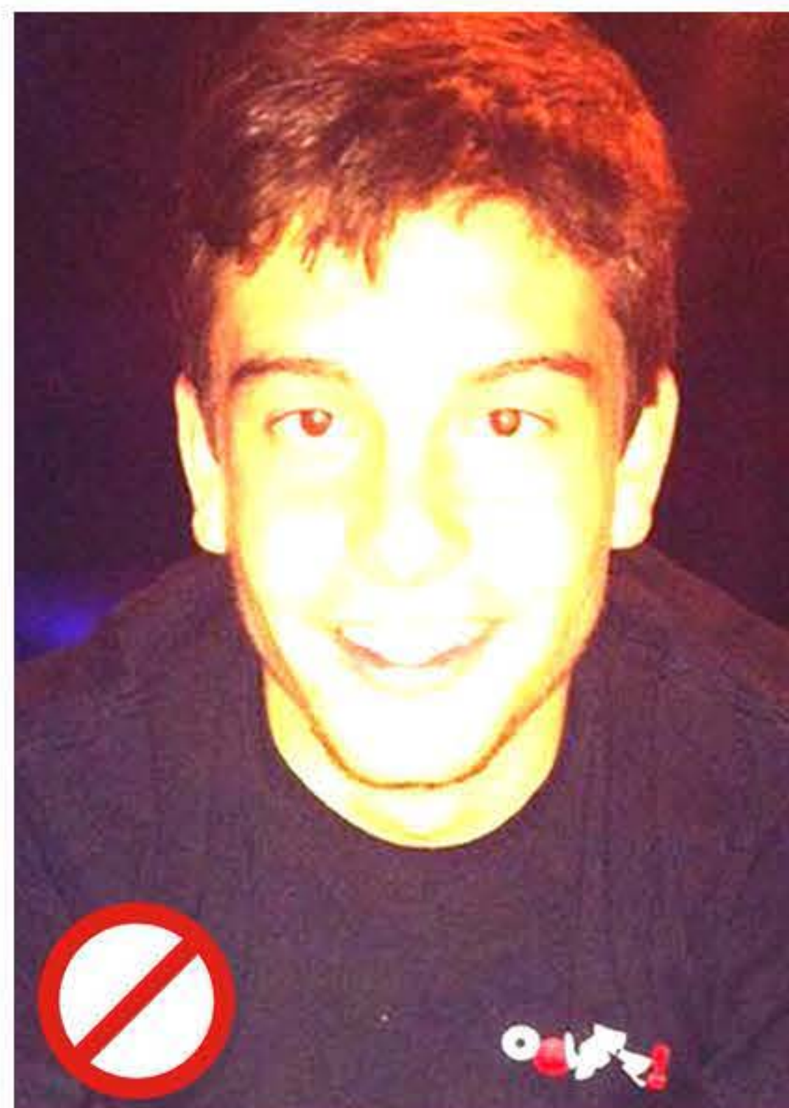
WASHED OUT NO DETAILS