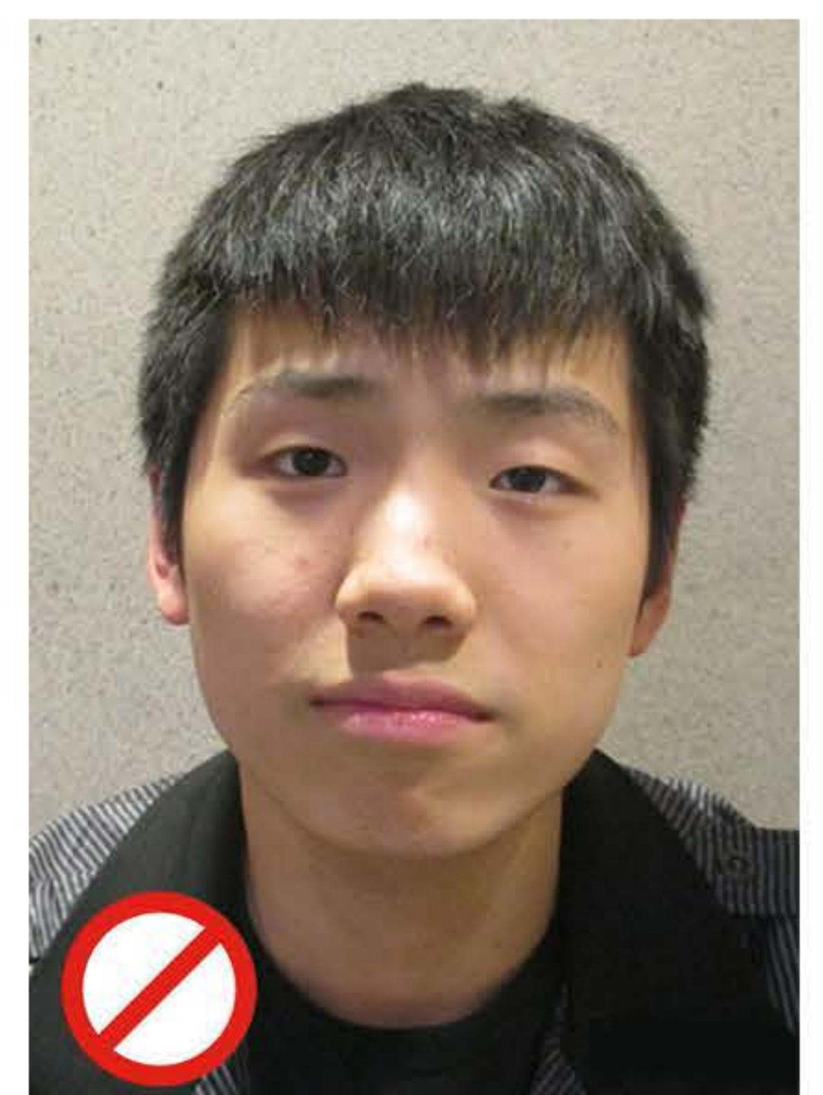
NO EXPRESSION DULL IMAGE