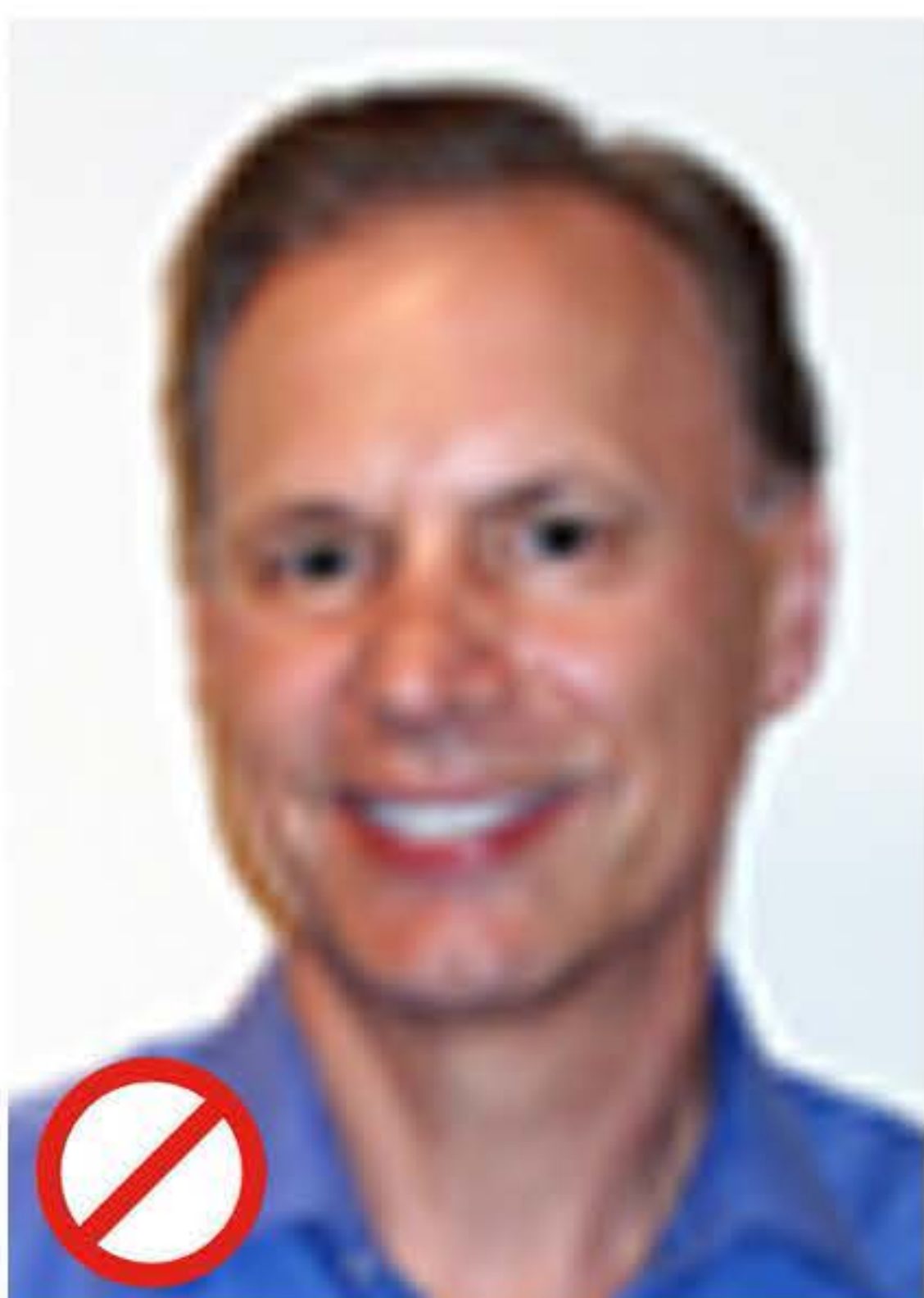
TOO SMALL LOW RESOLUTION NO DETAILS