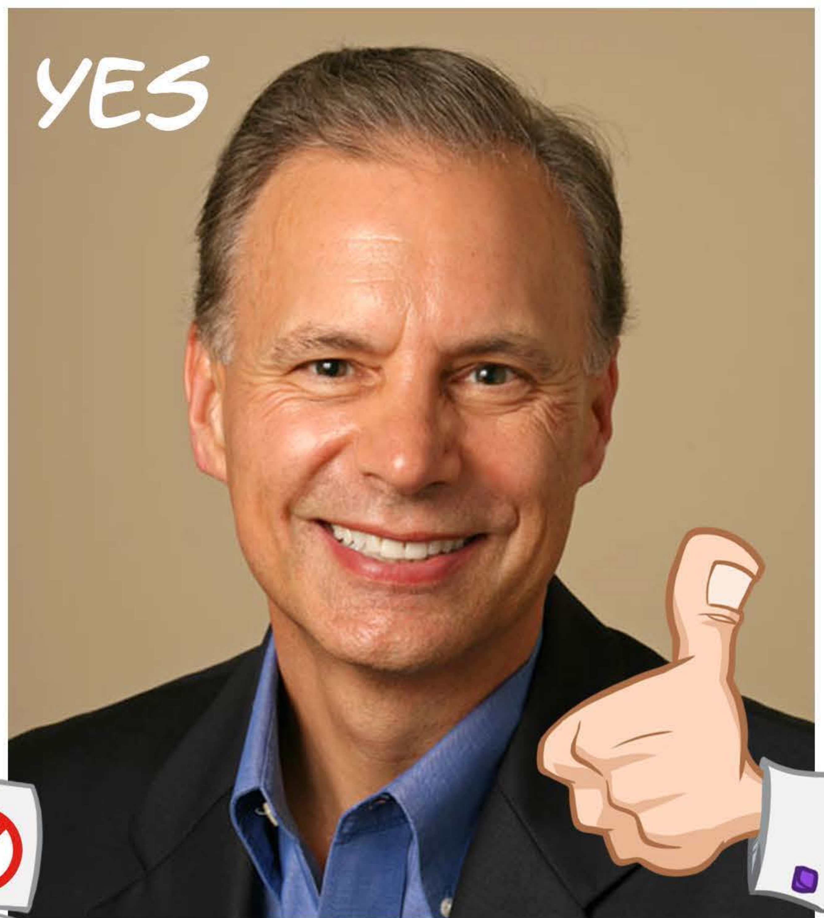
2ND PHOTO PROVIDED - PERFECT