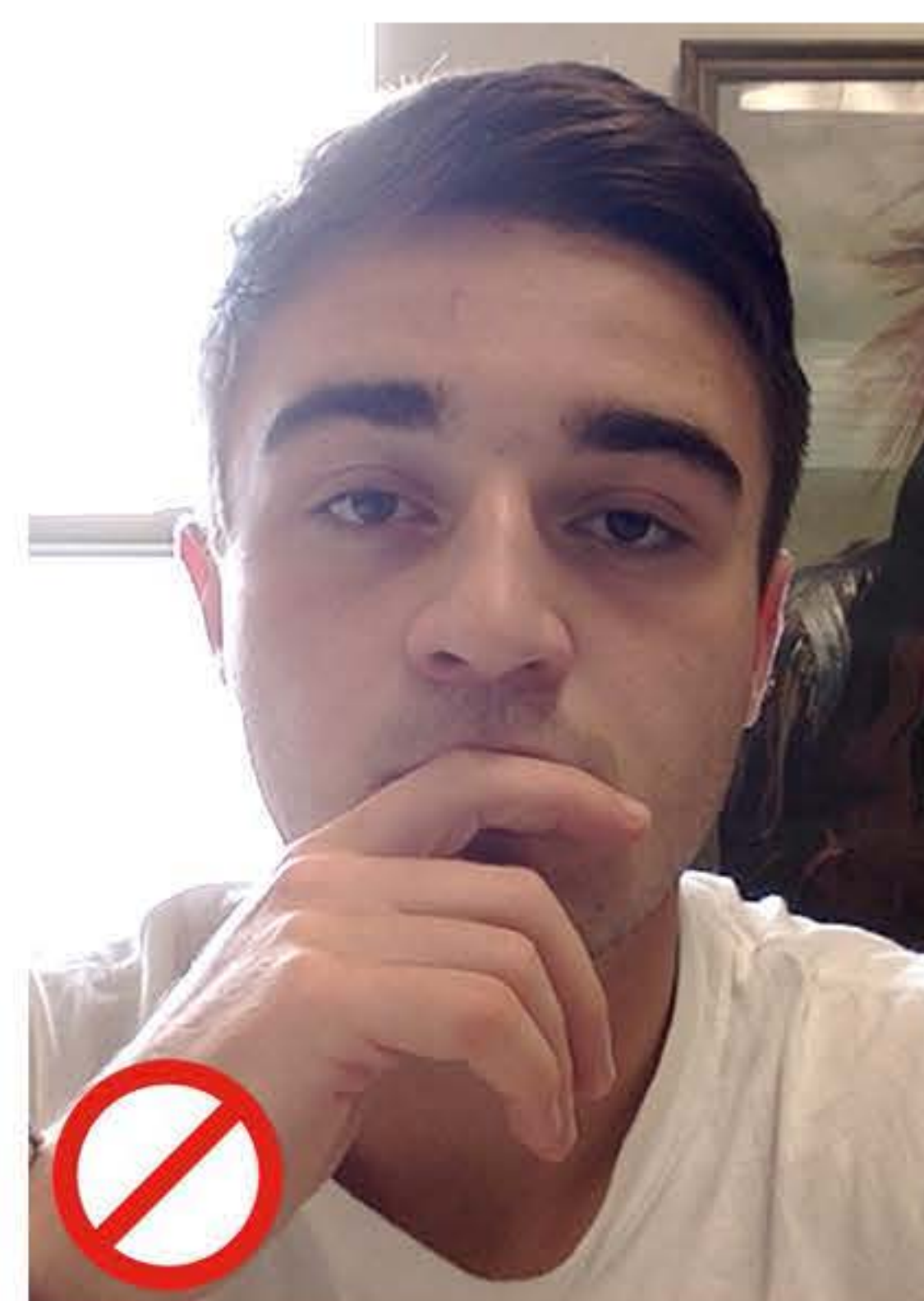
FACE BLOCKED FEATURES COVERED