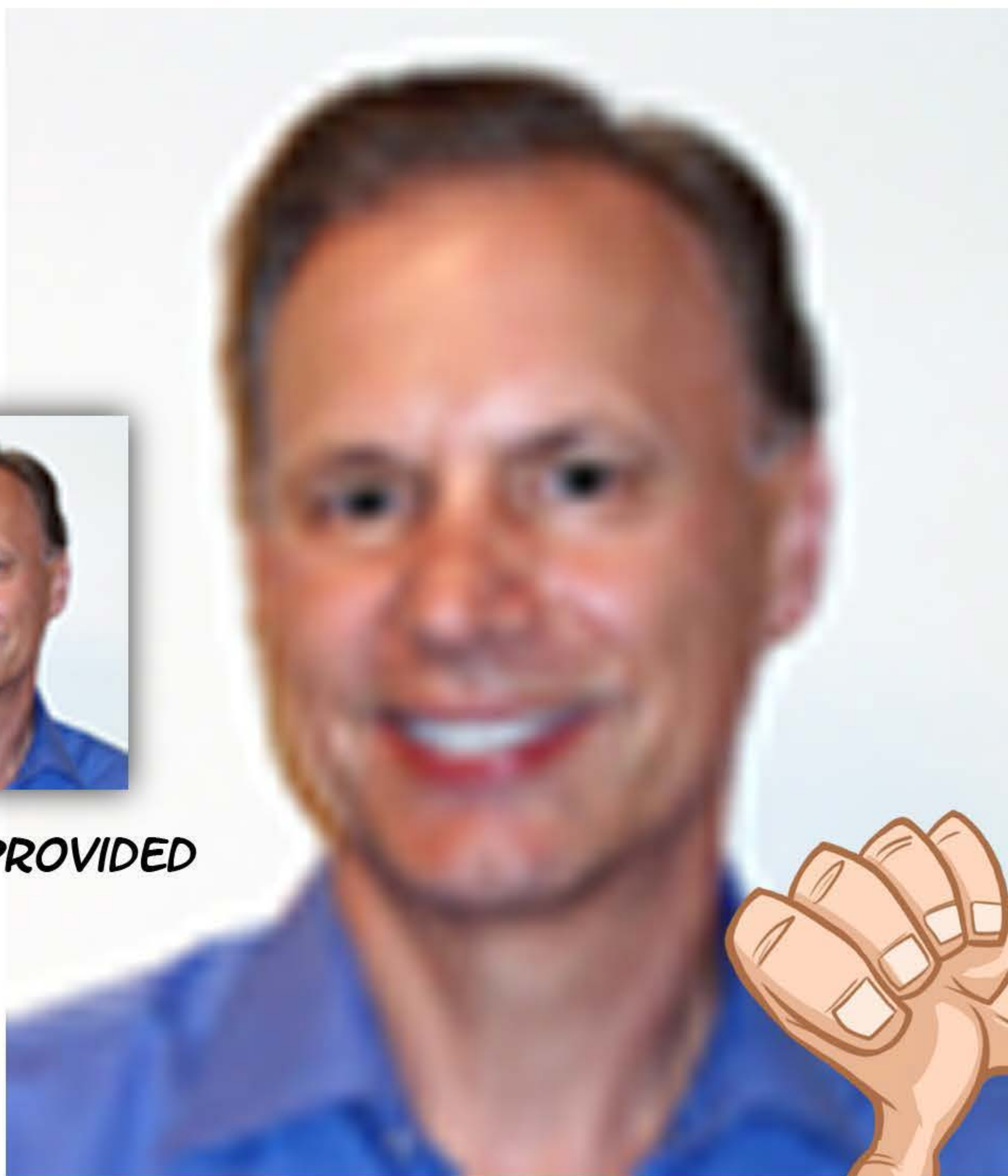
PHOTO ENLARGED - UNUSABLE