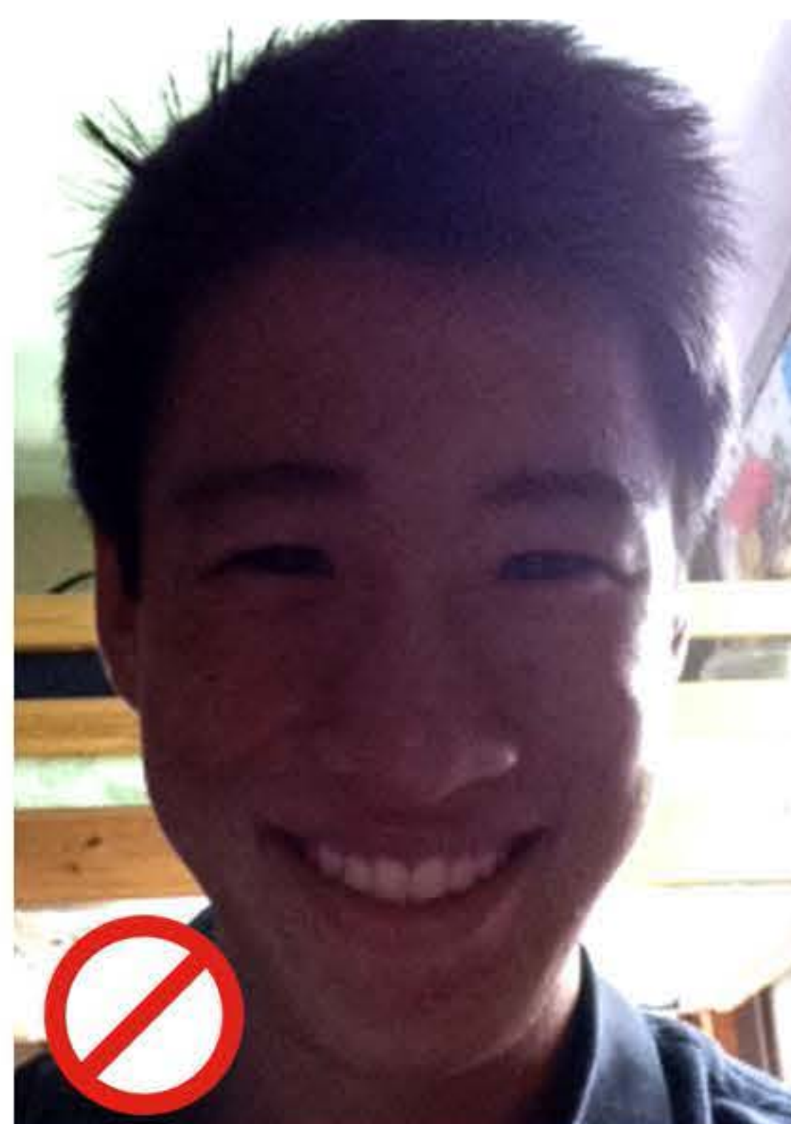
TOO DARK NO DETAILS